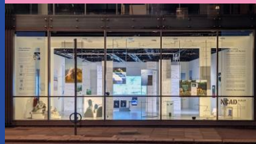
Image credit: © 'Infinite Becomings' exterior night view, NCAD Gallery, 2021.