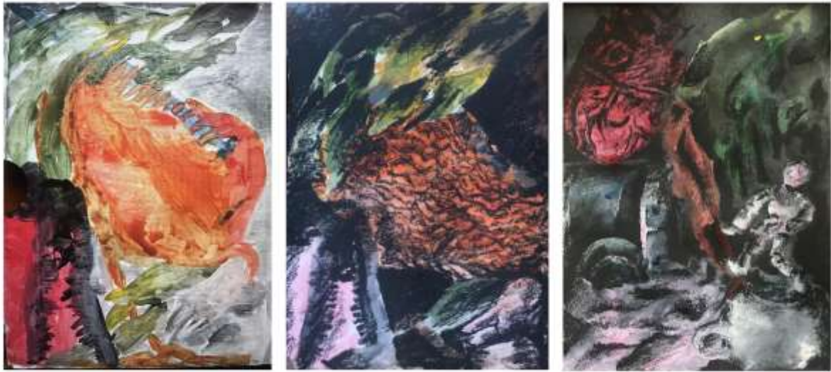
Still life in a box continued