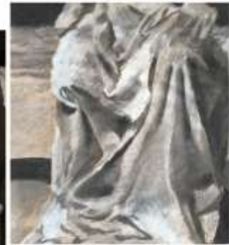
Fabrics interacting with the body