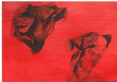
Immersed in water - ink on red acrylic

Fabrics are man made - made for humans by humans. Yet there is a freedom about them. They move freely, falling on bodies and objects and showing what they wish.