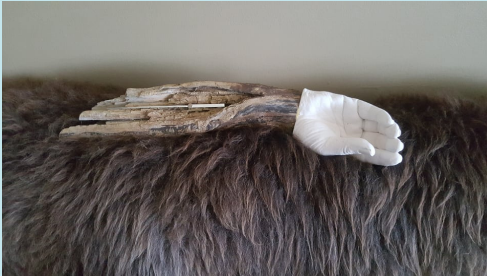
"Time Release" (2021) - plaster and found objects, Sculpture and Drawing (CEAD 1006)

We do not currently have a part time degree option as yet in NCAD that would have allowed us to continue our studies but the recent introduction of the Level 8 Higher Diploma in Art is a great step forward for part time students looking to progress. We worked together in The Plexus Collective from August 2018 and we had our first Exhibition in October 2019 and were working towards our next when the pandemic hit. I continued in CEAD with Sculpture and Drawing and completed this March which was interesting to do at home particularly the Sculpture section. I was involved in the Evening Students Union as Chairperson up until this September and with the assistance of a super committee helped realise our CEAD Online Exhibition this year. Our collective is back together physically after over a year of virtual catch ups and we are now working towards our next exhibition in 2022."