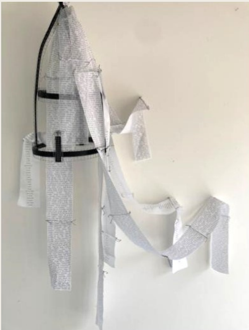
'Words Matter', 2022 wire, printed textiles. Enumerating the words used to silence women.

I then did the Higher Diploma in Art which had just become a two-year programme, two nights per week. This was a wonderful experience even though one year of the course was taken online due to Covid – it is amazing what you can achieve at home with a minimum of materials if you have the support of great tutors and fellow students."