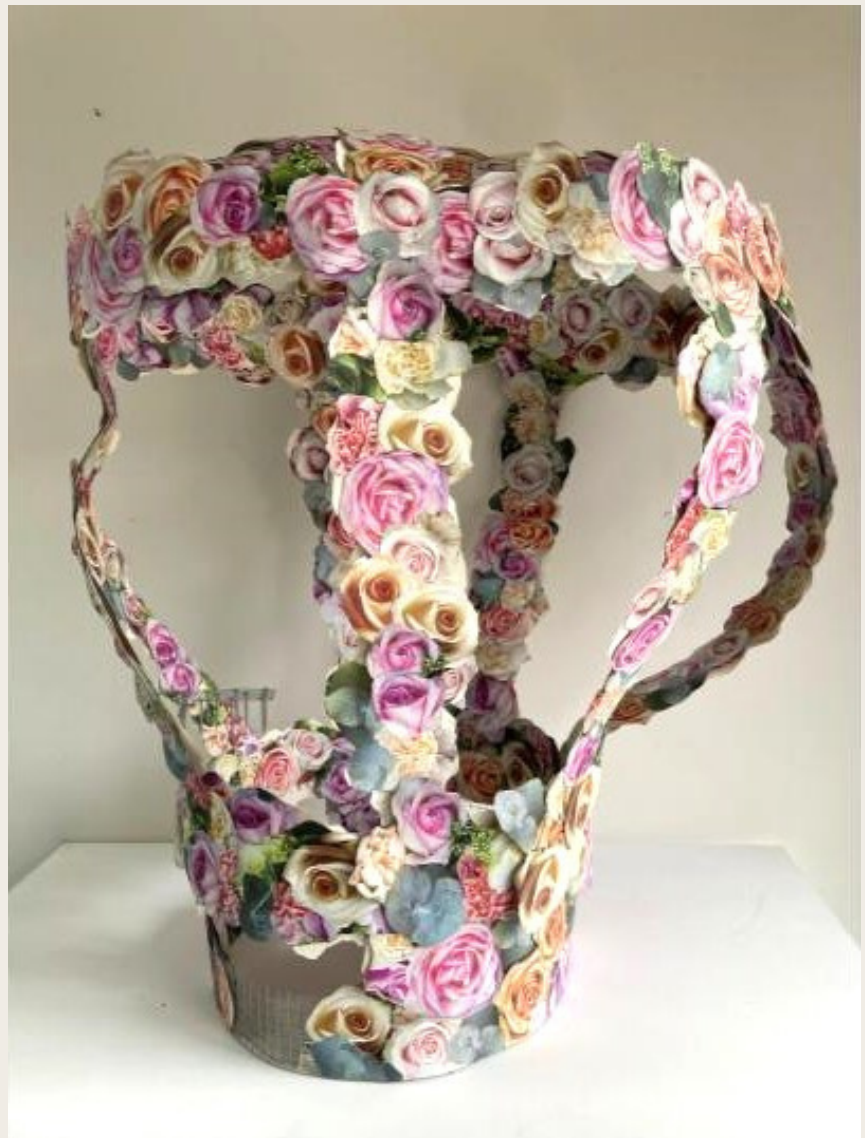
'Scold's Bridle', 2022 wire, wallpaper flowers. A method of torture presented as a bridal wreath.

"The Higher Diploma is a gateway to the full-time degree programme and I was delighted to be accepted into the Department of Applied Materials this year for the final year of a degree in Fine Art, Textile Art and Artefact. My interest is in textiles and 3D work with paper and other materials, so TAA is a good fit for me. I am a maker, driven by process and materiality and I enjoy the enquiry and research that informs the ideas behind each piece of work."