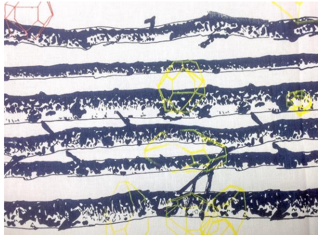
artwork from CEAD A/C 10 student, 15/16