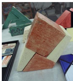
artwork from CEAD A/C 09 student, 15/16