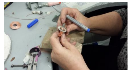
artwork from CEAD A/C 11 student, 15/16