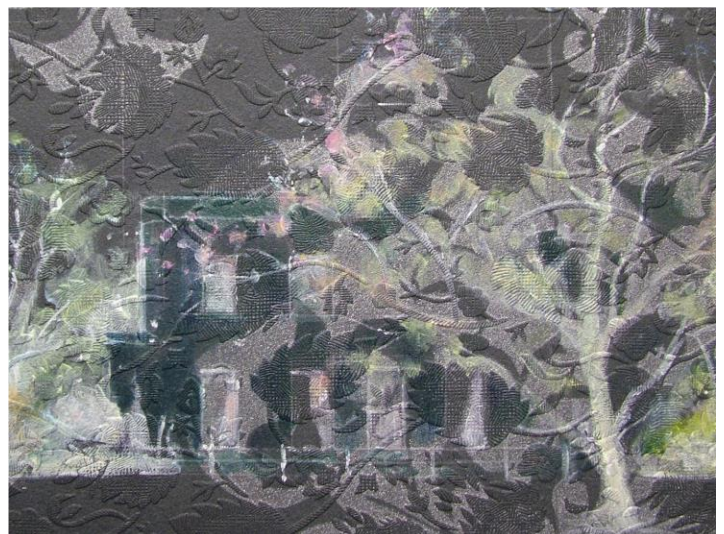
CEAD VAP A/C 03, Denis Kelly, Untitled 2009, Acrylic and water soluble pencil on found wallpaper, 35.5 x 37 cm