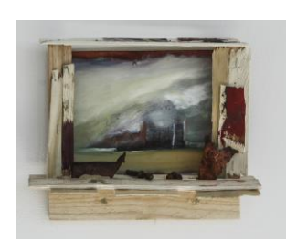
NCADGraduateShowcase (Education) 2017

Art cannot be created in isolation and the NCAD CEAD courses offer the chance to interact with other likeminded people and become part of an art community. This access to a highly skilled and creative community is to me the most important benefit that CEAD courses offer and I still keep in contact with friends from different CEAD courses.