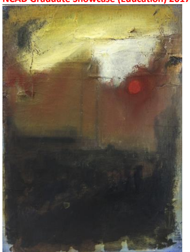
NCAD Graduate Showcase (Education) 2017

After completion of the P+DI certificate I was accepted for the CEAD one year part time Diploma in Art & Design . The course was a real challenge and was full on from start to finish. The course covered a wide range of media including 3D, drawing, digital media, print making, and was underscored by lectures in visual culture.