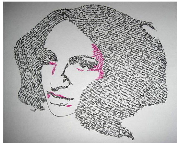
CEAD Cert drawing