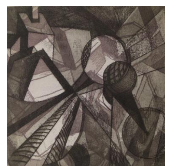
NCAD Degree early etching