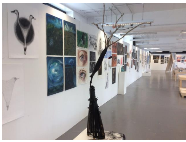
Work from the CEAD 2016 Graduate Showcase