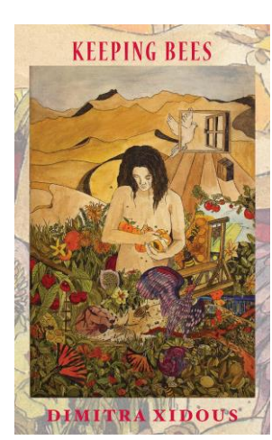
Illustration, Keeping Bees

Art Print faculty in 2013, taking the Joint course (where Visual Culture counts for a greater proportion of your timetable and marks). I was very fortunate to join a class of incredibly talented, focussed students who wholeheartedly welcomed the direct entry students.